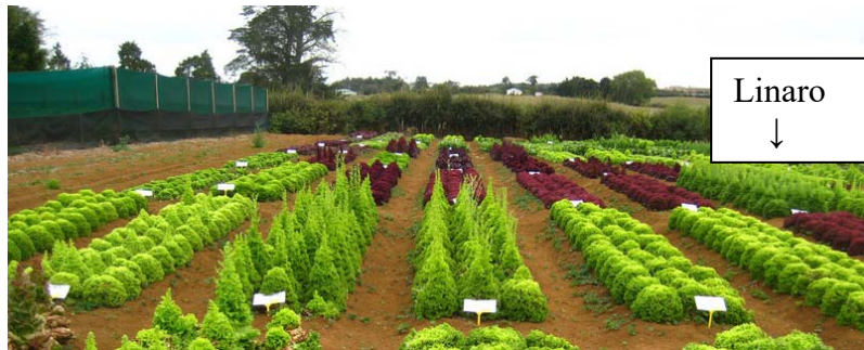
Photo Above: Pukekohe Field Day March 2010. Left to right; Levistro, Aleppo, Lorenzo, Licato, Livigna, Linaro